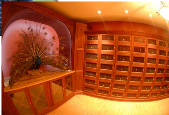
Member Wine Cellar