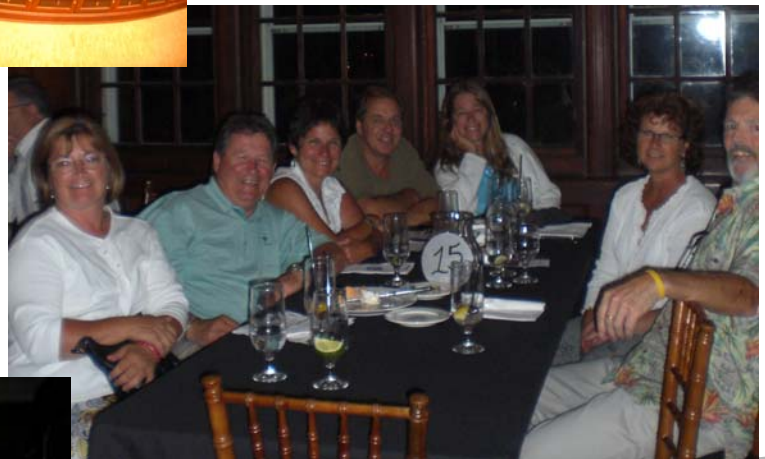
Easter Brunch 2008