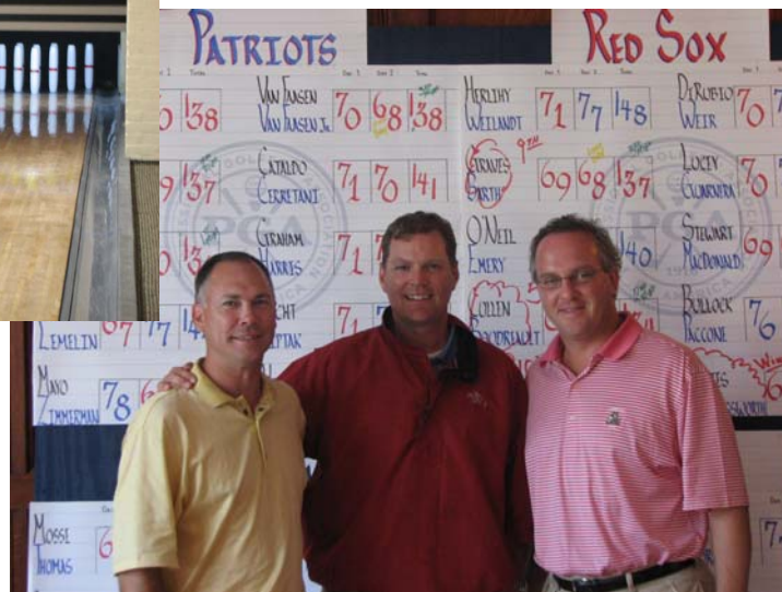
Champions Member/Guest 2008