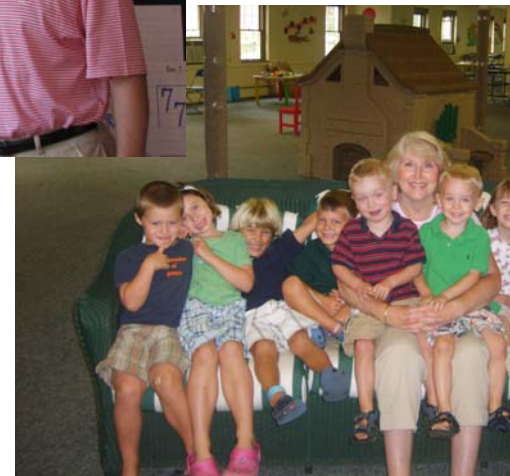
Kid's Club - SMILE! so