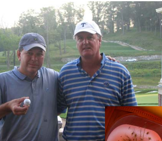
Member MiracleShot Member/Guest