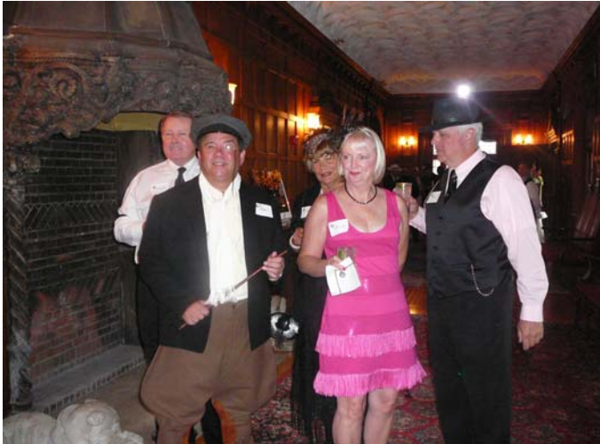
Mansion Grand Opening - May 2008