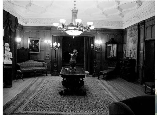
Shutter Island Movie Set - March 2008