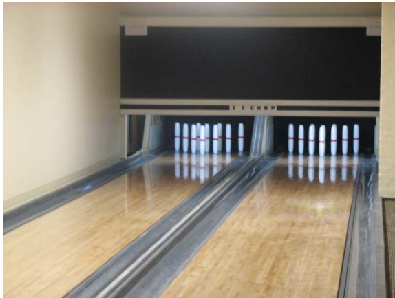
New Bowling Alley/Gameroom