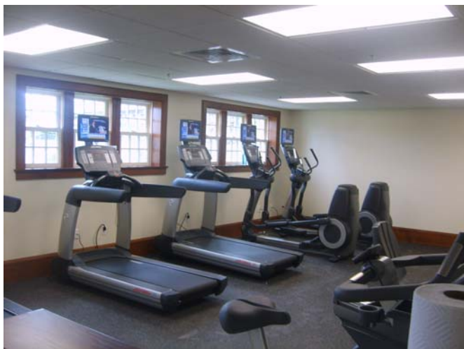
New Fitness Center