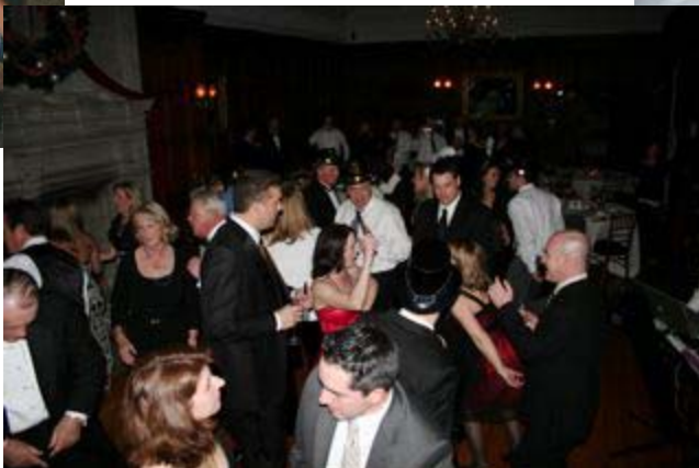
A packed dance floor at The New Year's Eve Ball - what a night!