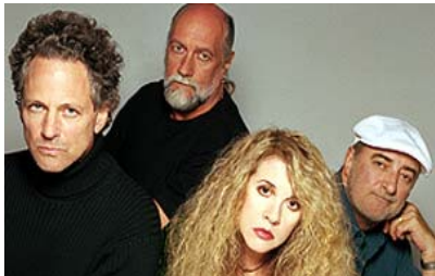
Fleetwood Mac suite available